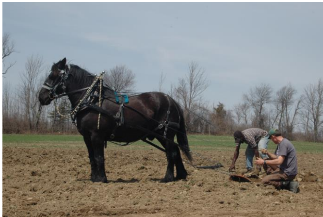
Tex is Fox Creek Farms draft horse. Here helping with picking rocks!

Summer squash, Radish, Parsley, and Spinach